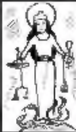
The Masonic Isis

The following is from page 144 of the official handbook of The Legion of Mary, 1975 edition, published by Concilium Legionis Mariae, Dublin, Ireland: